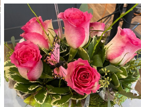
(Above) Flowers from Rose-Neath Florist on our raffle.